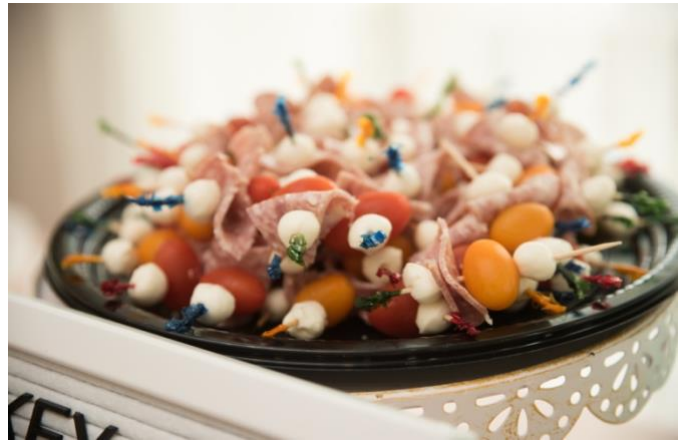
Salami Caprese Skewers Tray