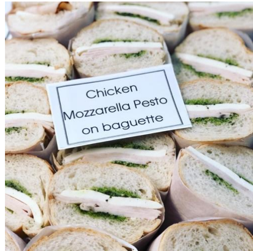
Chicken Mozzarella Pesto Platter