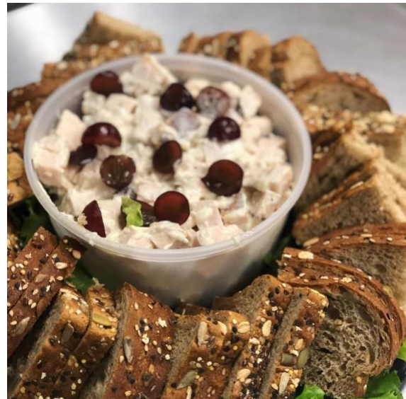
Chicken Salad Appetizer

494 N Seguin Avenue New Braunfels, Texas 78130 830 387 4053 info@bonjourtexas.com