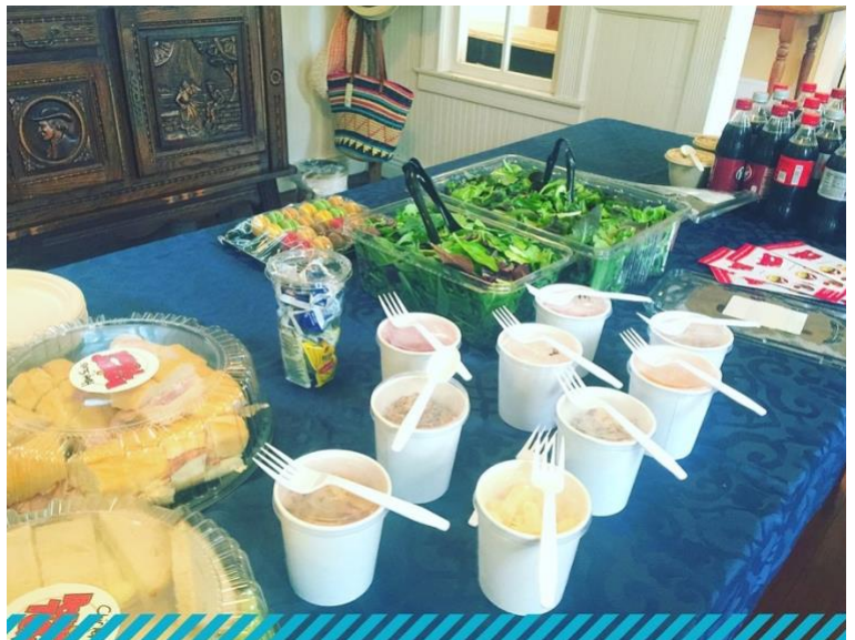
Build Your Own Salad Bar