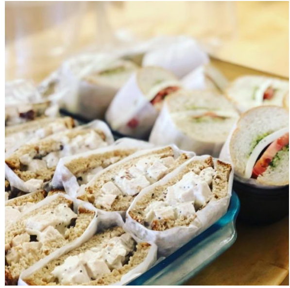
Chicken Salad on organic, wholegrain bread