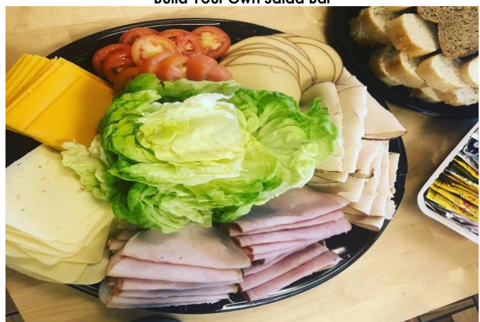
Build Your Own Sandwich Bar