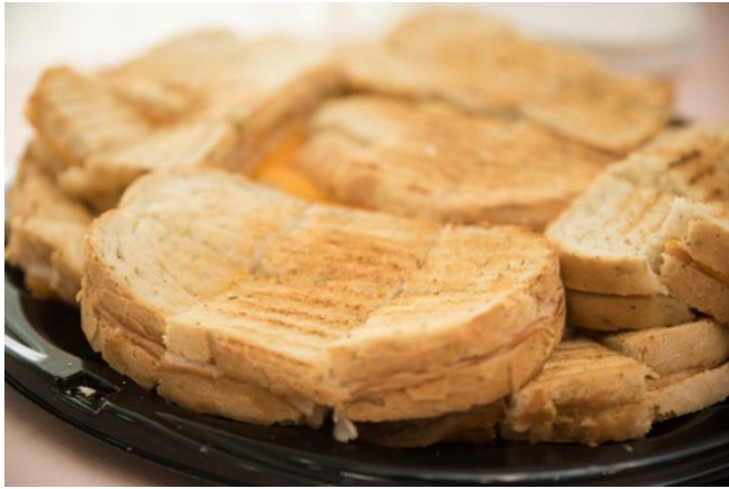
Turkey Cheddar Panini Sandwiches Tray