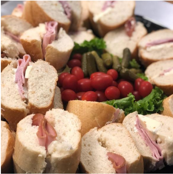
Ham, Salami & Mozzarella On Baguette Platter